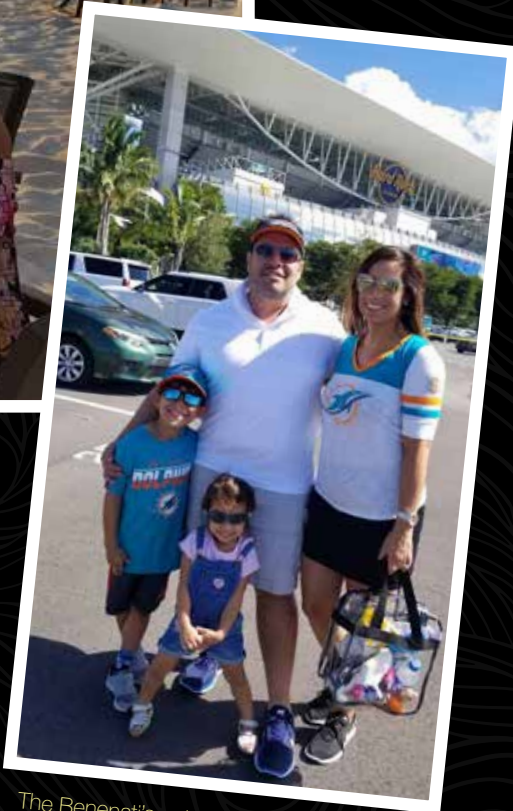
The Benenati's enjoying their latest trip to see their NFL team. They may not always win, but the family always has a fun time.