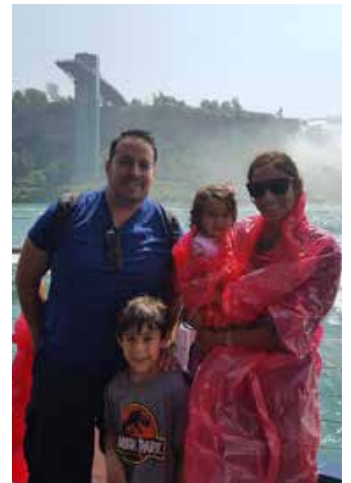
BOTTOM: During a recent trip to Toronto where the family got to experience Niagara Falls.